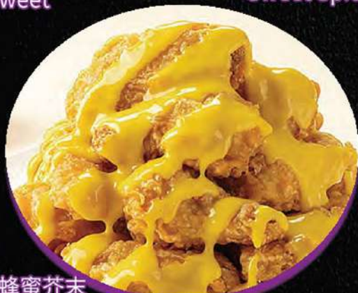
蜂蜜芥末 Honey Mustard