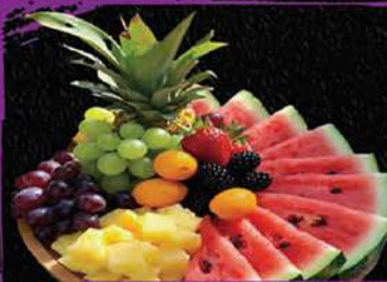
小等水果盘 Small Fruit Bowl