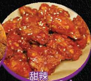
甜辣 Sweet Spicy